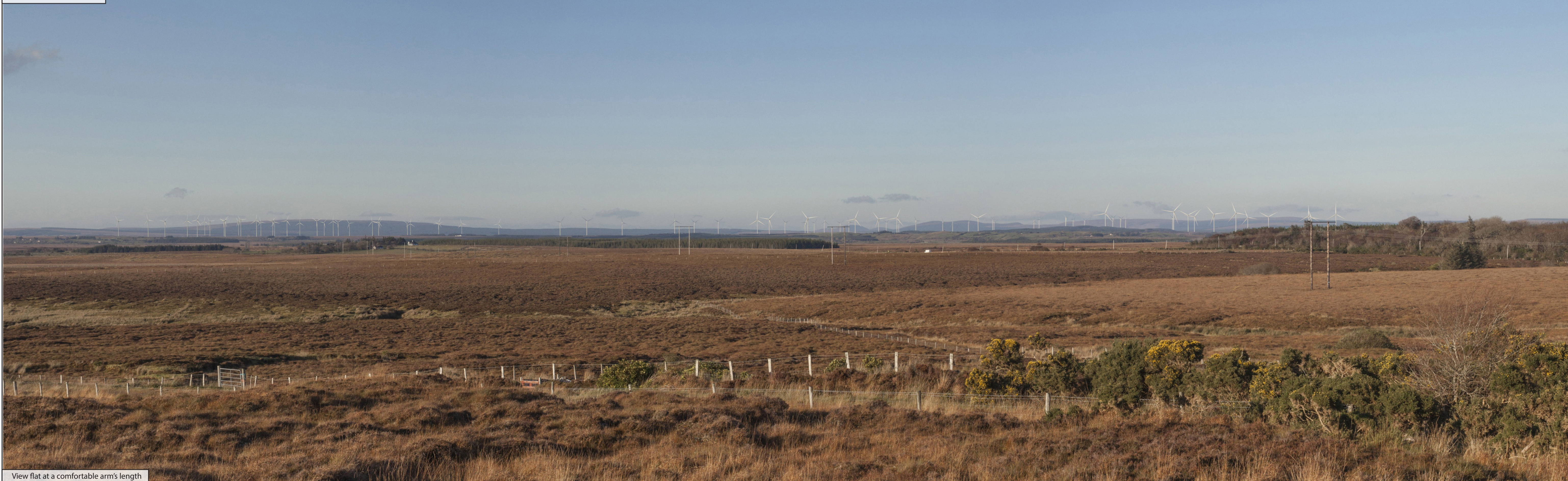
View flat at a comfortable arm's length

This planar projection panorama has been captured, prepared and presented in accordance with the guidance set out in the Scottish Natural Heritage 2017 guidance 'Visual Representation of Wind Farms'.